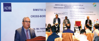
Dhaka, Bangladesh. Officials from all BIMSTEC member States participated in the workshop.

The BIMSTEC Secretariat in collaboration with the Asian Development Bank organized a Workshop on Cross-border Transmission Lines Optimization of the BIMSTEC Grid Interconnection Masterplan on 18-19 February 2024 in