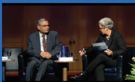
External Affairs of India and Department of Foreign Affairs and Trade of Australia.

Secretary General participated at the "Second Edition of Raisina Down Under 2024", on 05-06 November, 2024 in Canberra, Australia. The conference was organized by Observer Research Foundation and Australian Strategic Policy Institute, with the support of Ministry of