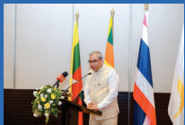
Regional Governance and Cooperation".

Secretary General delivered Plenary Address at the 4 th Bay of Bengal Maritime Dialogue held on 07-08 May 2024 in Colombo, Sri Lanka, organized by Pathfinder Foundation and Centre for Humanitarian Dialogue. He was also a Lead Speaker at the Panel Discussion on "Harmonising